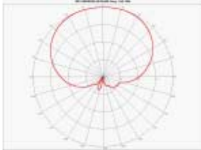
Azimuth Radiation Pattern Midband Freq. 2.45 GHz