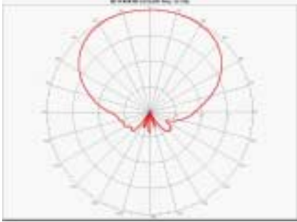
Azimuth Radiation 2.5915 GHz