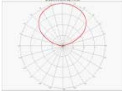
Azimuth Radiation Pattern Midband Freq. 5.725 GHz